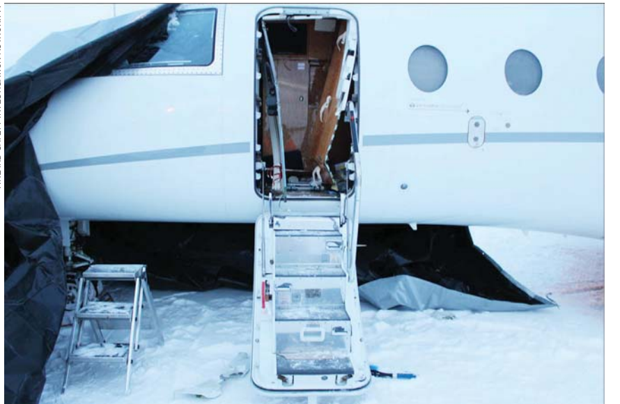
Post-accident view of the aircraft's main entrance door

When endorsing dual-qualified among their pilots, managers play a key role in the success or failure of that position. The decision to dual-qualify pilots is primarily an economic one but can also be driven by a desire to keep pilots proficient when the number of hours flown in each type is low. No matter the reasoning, mitigation strategies do not necessarily have to be costly. The most successful techniques that I've seen include the following: