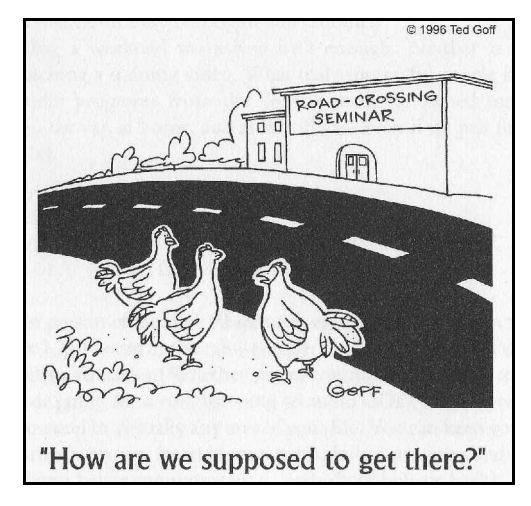
Figure 6. Are we supposed to wait to learn about leadership until we are a captain?

Since the birth of the CRM movement decades ago, some aviation companies have gone to great lengths to teach basic leadership skills and particular applications for captains. Other companies are still in great need of such programs. The sad reality is that some companies expect their captains to magically pick up the skills required of leadership through trial-and-error. Such an approach is akin to asking a captain to learn leadership skills by practicing such skills. One is left to ask, "What?" Figure 6 shows a cartoon that comes to mind in such situations.