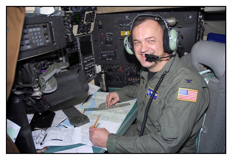
Figure 21. Imagine being a junior C-130 aircraft commander with this colonel as a navigator. 19