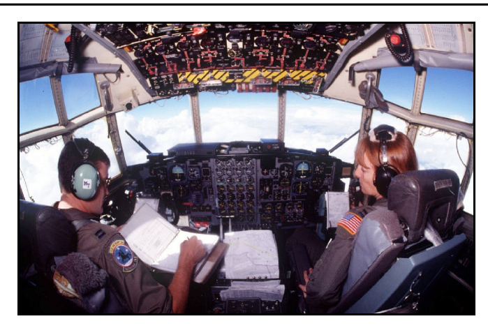
Figure 7. Captains use influence to form a team out of a crew. 11

In many ways, the pilot-in-command (PIC) of an aircraft, whether called a "captain" in civilian aviation or an "aircraft commander" in military aviation, is the chief executive officer (CEO) of the aircraft. Just like a CEO is responsible for the well-being of employees, satisfaction of customers, financial health of a company, and ethical decision-making, so too is the captain for all that regards a given flight where he or she is in command. Passengers, cargo customers, flight attendants, and other pilots on the crew all view the captain as essentially performing the same duties as a CEO.