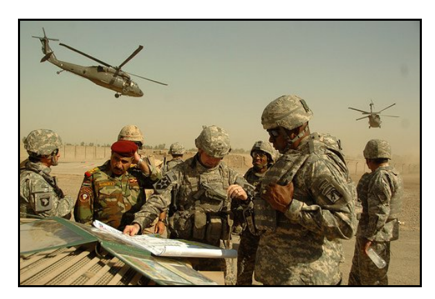
Figure 3. Sometimes it is obvious we are filling a leadership role. What about the other times? 10

Parents are the leaders of their families. Professors are the learning-leaders of their students. Senior employees are often, by default, leaders of their peers. Student teams have either designated or functional leaders that guide projects to fruition. It is a great tragedy to witness someone being appointed to a leadership position who does not grasp the fact that they are now perceived as leaders of a group. Often, such individuals continue functioning as a follower and never rise to the challenges of leadership because they are not even aware that such a requirement exists! All along, members of the group will turn to the "leader," either implicitly or explicitly, for guidance. When no such guidance is forthcoming from the leader, others may step up and assume the leadership role by exerting influence, or perhaps no one will attempt to do so. In either circumstance, the result is often confusion and frustration.