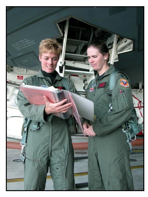
Figure 8. Set the tone early and it will pay dividends throughout the rest of the flight. 13

Captain's must recognize the importance of first impressions. The first few minutes when a captain meets his or her crew are paramount for setting the proper tone for the flight. Remember that what a captain does during those first few minutes of his or her leadership when meeting a crew is an accurate predictor of overall crew performance later during the flight.<sup>12</sup>