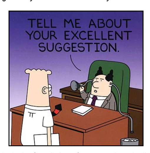
Figure 10. Sincerity is the foundation of respect when dealing with your crew.

The tone can also be set by projecting enthusiasm for the flight that lies ahead and by explaining that the flight will be run in strict accordance with standard operating procedures. Many captains invite participation in the decision-making process of the flight by stating that they encourage input from the crew. Lines of communication can further be opened when a captain states that he or she also makes mistakes. Perhaps one of the best tone-setting statements that can be used is when a captain briefs, "I follow SOPs. If you see us deviating from SOPs without me having briefed why, bring it to my attention immediately."