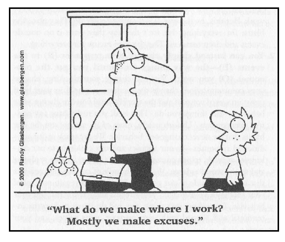
Figure 13. Good leaders own up to mistakes, fix them guickly, and move on.

Leading by example means that the captain should be an enthusiastic champion of the mission and should try to motivate his or her crew to excel in meeting the mission objectives. It also means that captains should readily acknowledge mistakes instead of constantly working to protect personal image or ego. The captain should always follow-through on what he or she previously agreed to accomplish and should be quick to accept responsibility for any shortcomings of the crew while striving to make corrections.