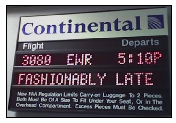
Figure 11. Sometimes humor is the only way out of inescapable situations.

Difficult situations are bound to arise during a flight. Sometimes the situations are a result of friction between crewmembers. Other times, irate passengers or company officials can create tense situations. A capable captain may consider the use of humor to diffuse difficult situations, but tact must be used so that no one is offended.