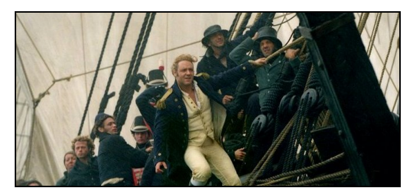
Figure 2. Follow me because you want to; because I will take you where you want to go.

ineffective and effective leadership can therefore be seen in the way that influence is operationalized."<sup>5</sup> Such a concept of influence has been investigated by others. For example, some define leadership as the use of "non-coercive influence to direct and coordinate the activities of the members of an organized group towards the accomplishment of group objectives."<sup>6</sup>