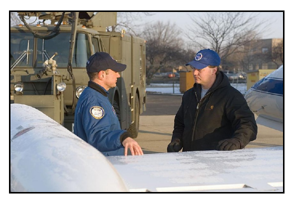
Figure 9. If you do not set the tone, you have set the tone. 14

captains who skip this briefing, "By not setting the tone, you have set the tone." That is why this key event is called the "CRM Briefing." It takes place at the start of every day and can be accomplished at any time prior to commencing checklists. It should be briefed by the captain and should strive to accomplish all items that are general to the flight or series of flights that the crew is paired to fly.