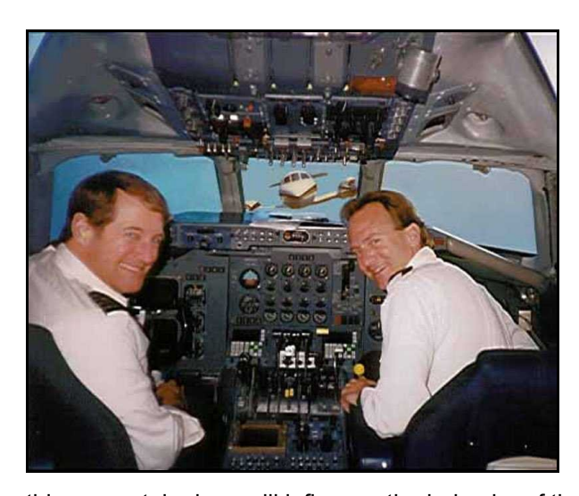
Figure 12. Everything a captain does will influence the behavior of the crew.

A captain should always strive to set the example for the crew and for other company employees who may not be on the immediate crew. Depth of commitment to the company and to the particular flight can be exemplified by going beyond the work that is expected of the captain. Some would even advocate that captains lend a hand to ramp agents when they are falling behind on their bag-loading or with flight attendants or cleaning crews who need help preparing the cabin. However, such practices are fraught with controversy from the perspective of pilot unions, can distract pilots from their primary workload, and incur the risk of injury for performing tasks that one has not been trained to do.