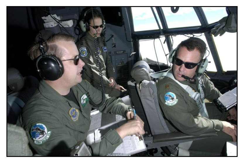
Figure 16. What proactive actions do you take to create a climate of respect in the cockpit? 17