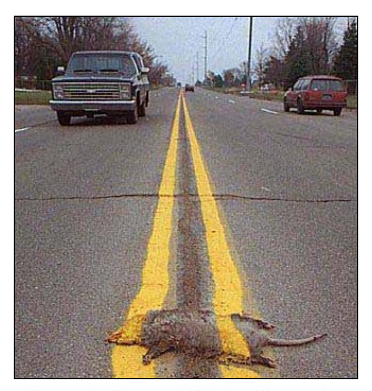
Figure 18. This picture illustrates the "It's not my job" mindset. We must adopt a sense of ownership.