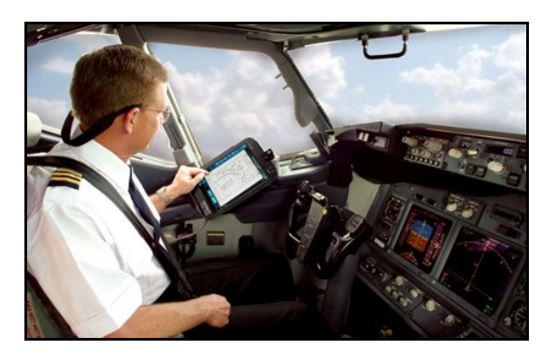
Figure 5. This captain is a skilled technician, but has he ever been taught how to lead his crew?

Since the birth of the CRM movement decades ago, some aviation companies have gone to great lengths to teach basic leadership skills and particular applications for captains. Other companies are still in great need of such programs. The sad reality is that some companies expect their captains to magically pick up the skills required of leadership through trial-and-error. Such an approach is akin to asking a captain to learn leadership skills by practicing such skills. One is left to ask, "What?" Figure 6 shows a cartoon that comes to mind in such situations.