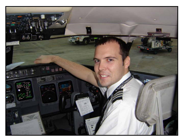
Figure 17. What words would a captain use to describe an ideal first officer? 18

Since captains represent people from all walks of life who have different value systems and perspectives, opinions tend to vary as to the specifics of what makes a good follower. Some captains may describe an ideal first officer as someone who is eager to learn, really makes an effort to fly well, and respects the captain. At the other end of the expectation spectrum, captains may describe their ideal first officer as one who shows up to the aircraft early and not only accomplishes the typical first officer tasks, but also completes much of the captain workload. Such a captain may expect the first officer to set up airspeed bugs for the captains, make sure that the seatbelts are fully extended so that the captain does not have to inconvenience him or herself with such a menial task, write down the ATIS and clearance and clip it to the yoke of the captain, and have a cup of coffee waiting next to the captain's seat (prepared exactly as the captain likes it, of course).